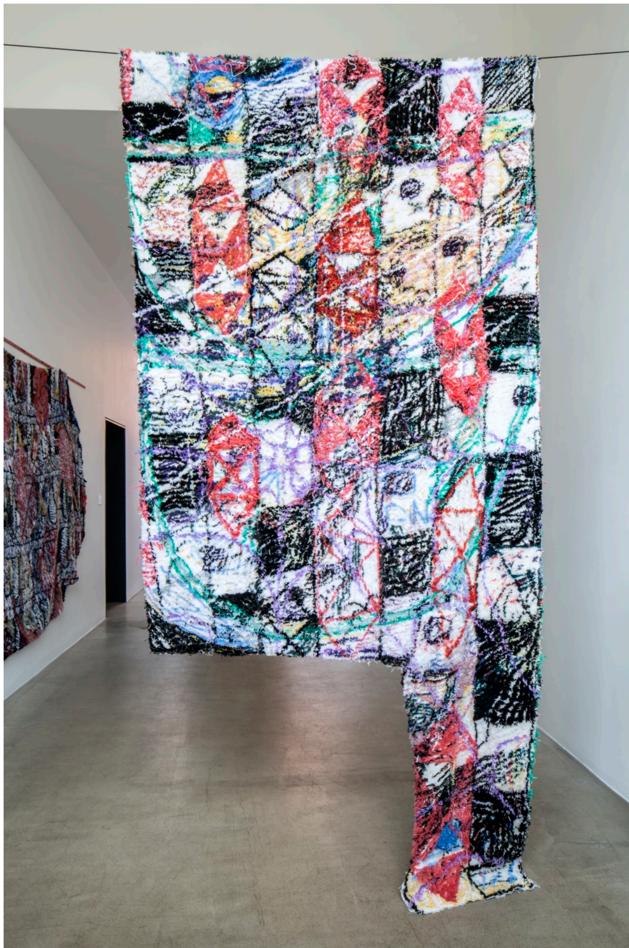
Christian Newby hsbc , 2019 Tufted wool on cloth 290 x 174cm/ 114.17 x 68.5in Unique