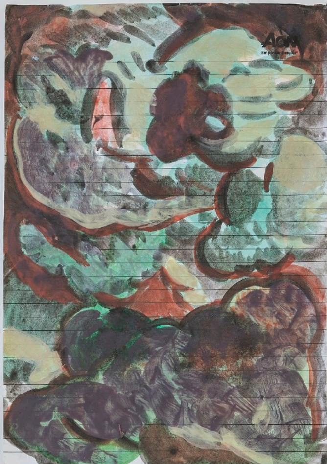
Christian Newby HK2, 2019 Acrylic on stationary 20.5 x 14.5 cm / 8.07 x 5.7 in Unique 1070 GBP + VAT