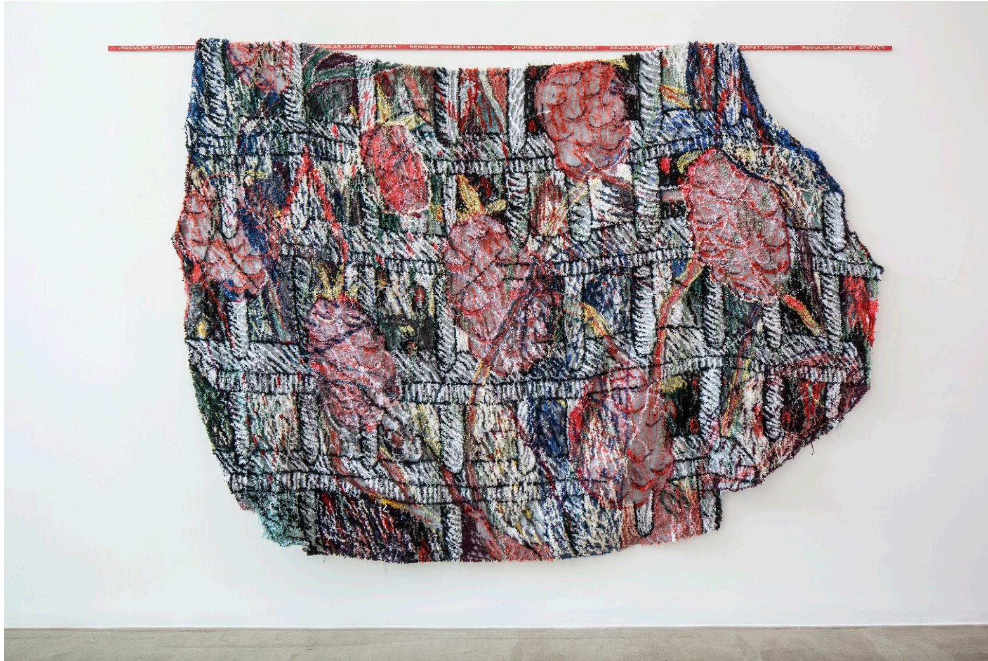
Christian Newby Raspberry-Jail, 2020 Tufted yarn on cloth 135 x 290cm / 53.14 x 114.17in Unique