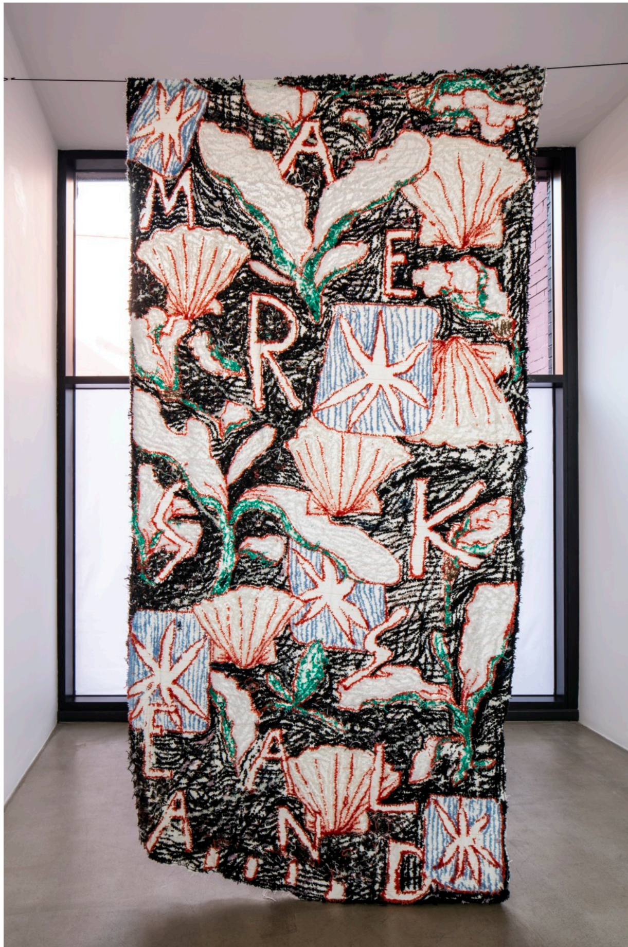
Christian Newby Maersksealand, 2019 Tufted wool on cloth 285 x 135 cm / 112.2 x 53.14in Unique